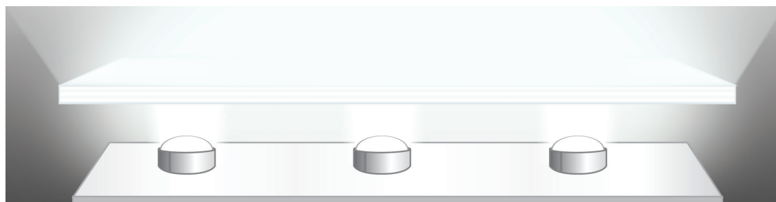
Transmission and Hiding Performance* of Plexiglas® Frosted and Diffuse™ Resins at Full Strength (100% Loading) and Dilutions

Plexiglas® Diffuse™ resins are specifically formulated to enable efficient LED systems to offer high output and uniform illumination. These resins may be easily processed using injection molding or extrusion. They are also sufficiently concentrated to allow lens makers to formulate them with other Plexiglas® resins via extrusion for tailored lens properties, if desired. A wide range of performance is achievable using Plexiglas® Frosted and Diffuse™ resins (see below).